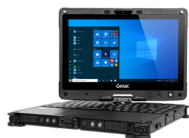
V110 Convertible RFID