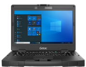
S410 Laptop RFID